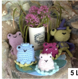
5 Little Frogs