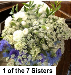
1 of the 7 Sisters