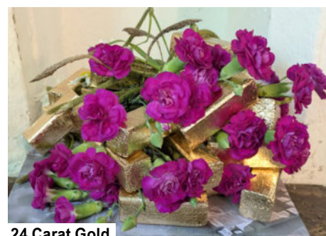
24 Carat Gold