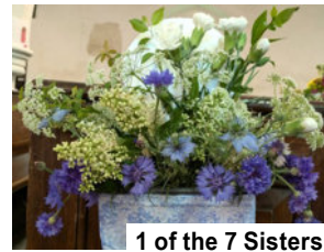
1 of the 7 Sisters