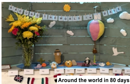
Around the world in 80 days