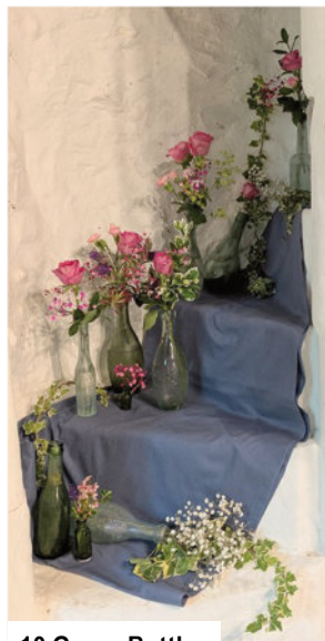
10 Green Bottles

Find more about the Flower Festival on pages 2, 9 and 11