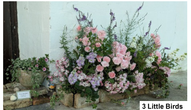
3 Little Birds