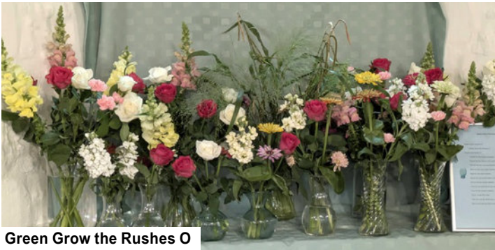
Green Grow the Rushes O