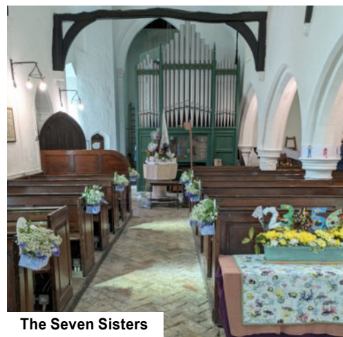
The Seven Sisters