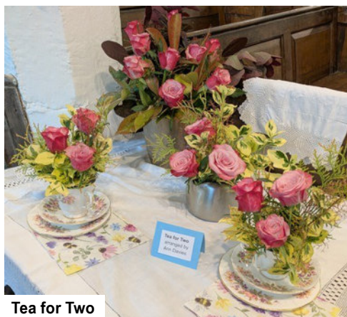
Tea for Two