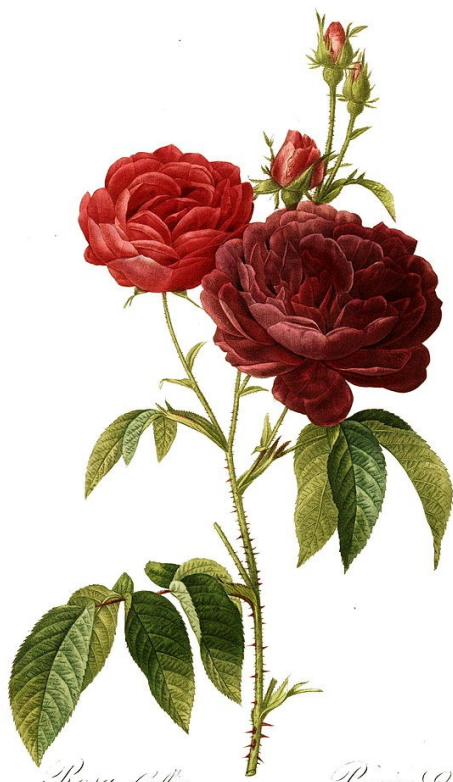
Rosa Gallica ( Rosa gallica purpurea magna )