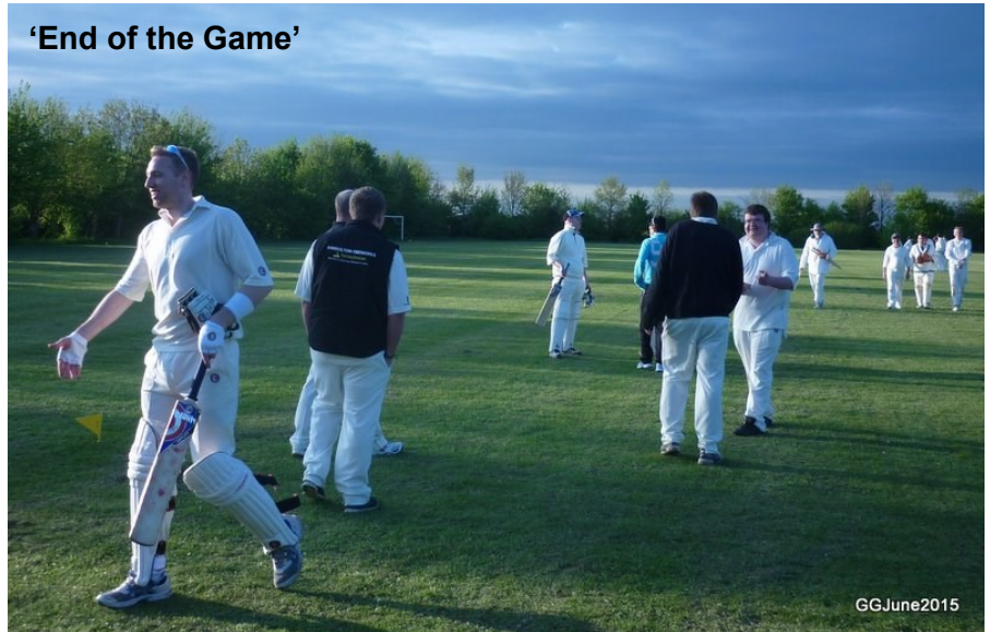
'End of the Game'

Saturday 20 th June Grafham vs Road Runner: Start Time 1.30pm