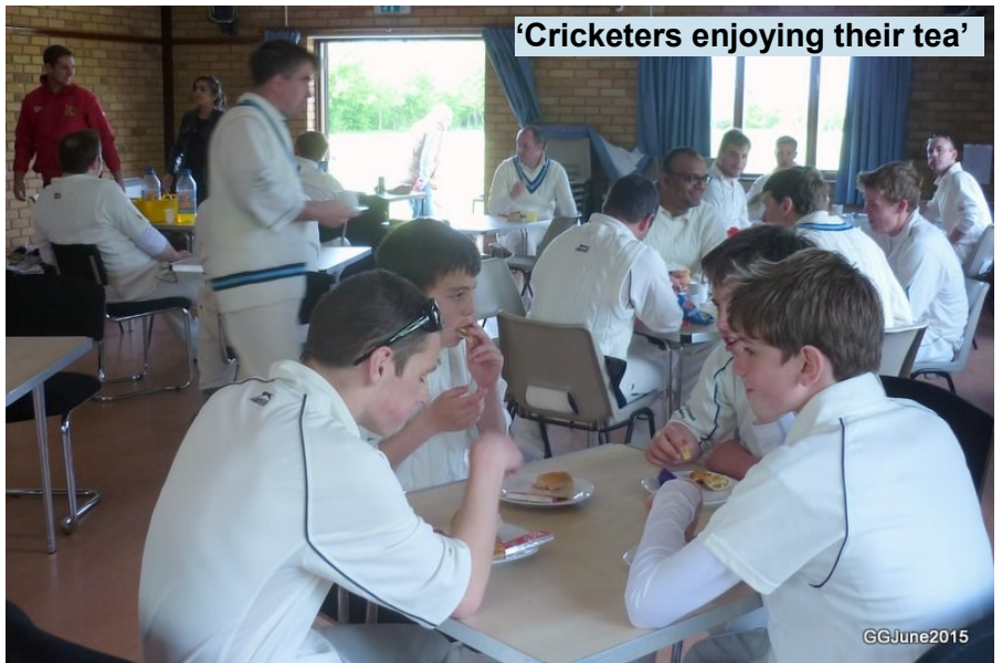
'Cricketers enjoying their tea'